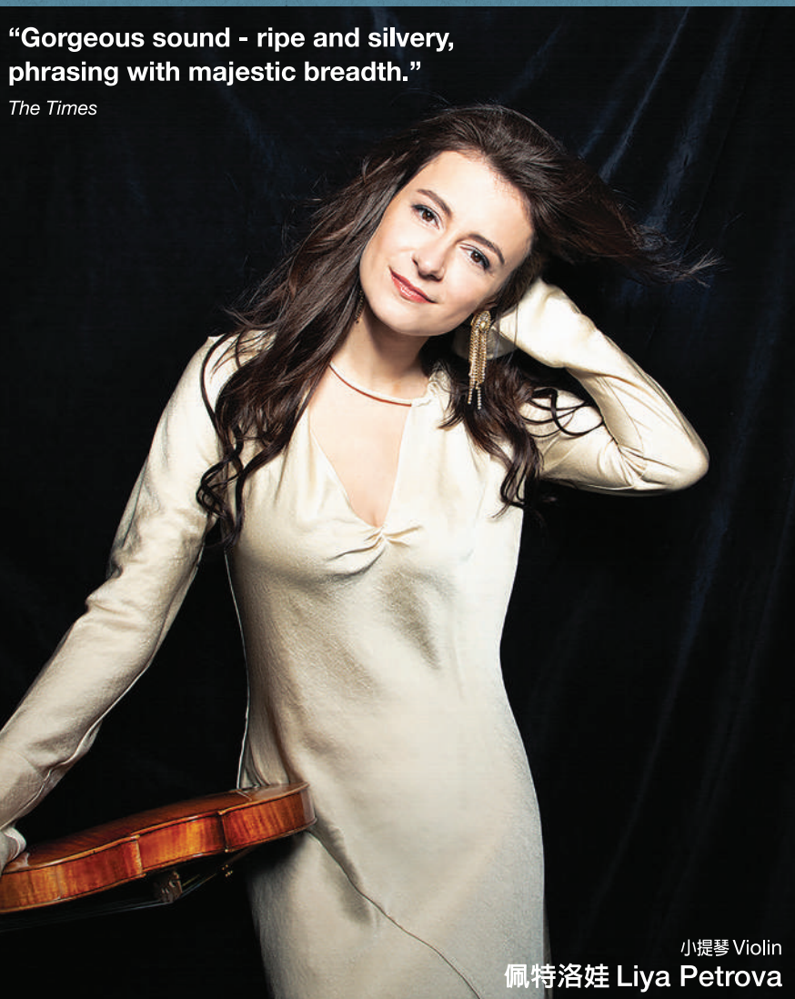
小提琴 Violin 佩特洛娃 Liya Petrova

“Gorgeous sound - ripe and silvery, phrasing with majestic breadth.”