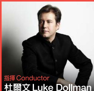
指揮 Conductor 杜爾文 Luke Dollman

14.9.2024 星期六 Sat 8pm 香港大會堂音樂廳 HK City Hall Concert Hall $480 $340 $200