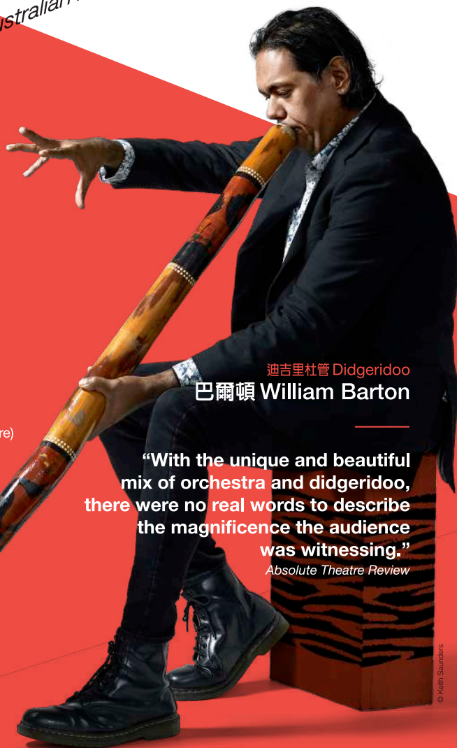
迪吉里杜管 Didgeridoo 巴爾頓 William Barton

"With the unique and beautiful mix of orchestra and didgeridoo, there were no real words to describe the magnificence the audience was witnessing."