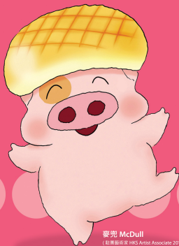
麥兜 McDull (駐場藝術家 HKS Artist Associate 2019-2020)